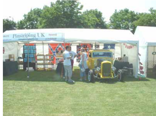
Our Shop & Drive in Striping Parlour in action – Bovington 2006

Normally the season kicks off with Wheels Day at Rushmore Arena in Aldershot run by Surrey Street Rodders. Although this traditionally takes place on Good Friday this year Easter has moved further into April and Wheels Day will be on 14 th April. This means that the Spring Nationals at Billing Aquadrome will take place before Wheels day on the 7/8/9 April