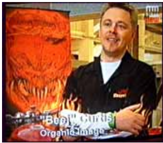
Notable work includes

Beej is located near Salisbury in Wiltshire. Probably one of our better known artists. Not only can he provide awesome graphics for your ride, but he now offers a range of classes for the airbrush enthusiast. Beginner to advanced.