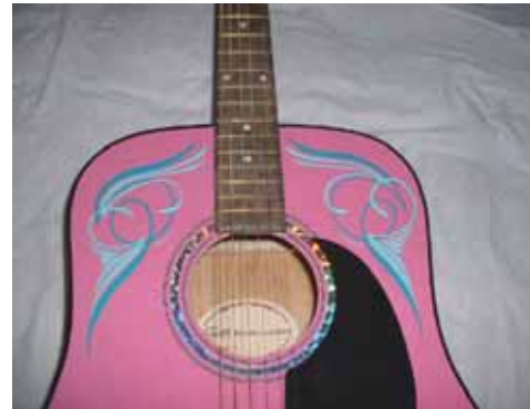
Acoustic guitar striped for Pinstripes & Pistons Exhibition

By playing with the thick and thin possibilities of the lines you will be able to create leaves and spears used to dramatic effect by such as Kafka & Wizard and of course our own Neil Melliard.