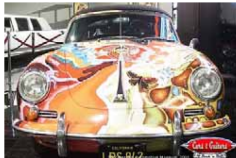
Janis Joplin Porche

The Pinstripping on some of these cars was awesome. The Bruce Meyer Hot Rod Gallery brings together some of the most publicised and best remembered rods and paint jobs of all time.