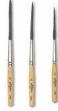
Kafka Scroll brushes