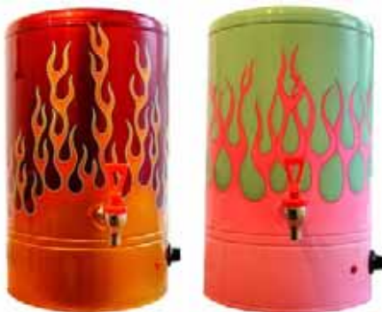
One of these urns is now in the Tate Modern! Kris's commission was for outlining the flames.

KJ: Never be afraid to wipe off your design and start again. It's a sure bet that if you aint happy the customer won't be either. On days when nothing goes right – give up – there is always tomorrow.