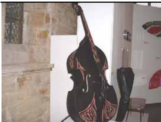
Double bass Melissa Gee