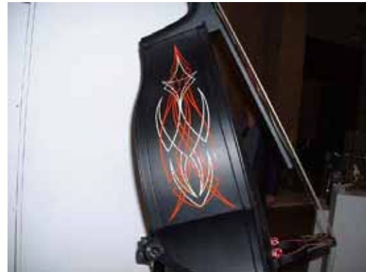
Tools of the trade