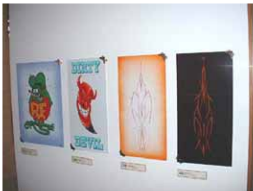
A range of great plaques by Tootall